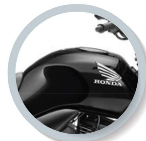
Pearl Igneous Black

+ The technical specifications and design of the vehicles may vary according to the requirements and conditions without any notice Unicorn meets Bharat Stage VI norms. Product shown in the picture may vary from actual product available in the market. Accessories shown in the picture are not part of standard equipment. ^ Only rear tyre is HET. ** Conditions apply.