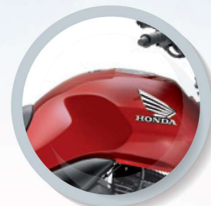
Imperial Red Metallic