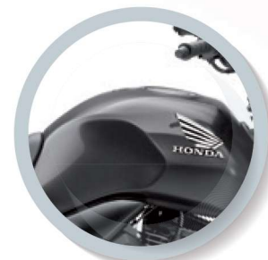
Mat Axis Gray Metallic