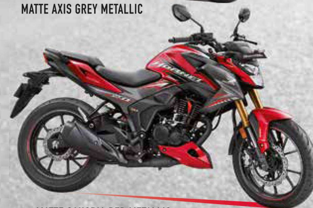
MATTE SANGRIA RED METALLIC

BOOK ONLINE NOW! www.honda2wheelersindia.com