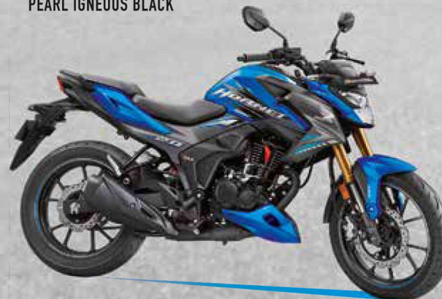
MATTE MARVEL BLUE METALLIC