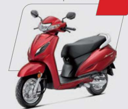
Pearl Spartan Red