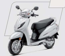
Pearl Precious White