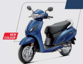
Glitter Blue Metallic